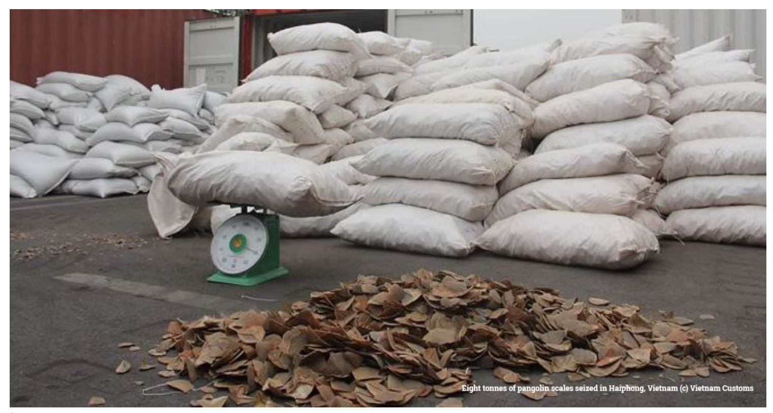
Figure 1: Several tons of pangolin scales seized in Vietnam